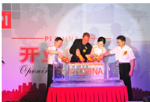
Grand Opening PI-China, 31 August 2012

The PI herewith completes its range of services across the entire value chain from module to field operations: PI engineers audit the production process on the ground and pull, as independent experts, patterns directly from production or containers prior to shipment. These modules are tested either in Berlin or Suzhou by the PI quality packages.